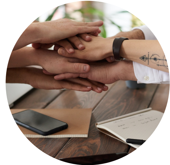
5. GOVERNMENT SUPPORT