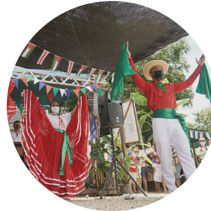
4. CITIZEN EMPOWERMENT