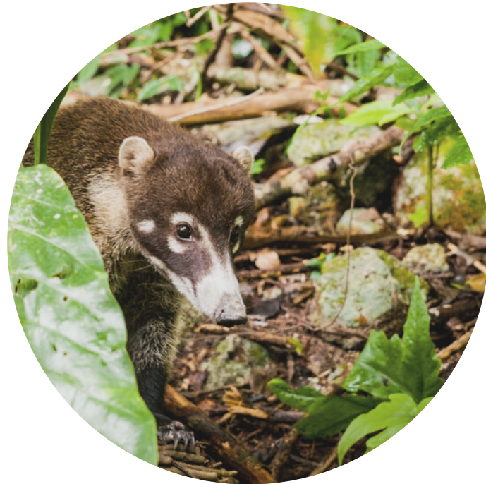
2. BIODIVERSITY CONSERVATION