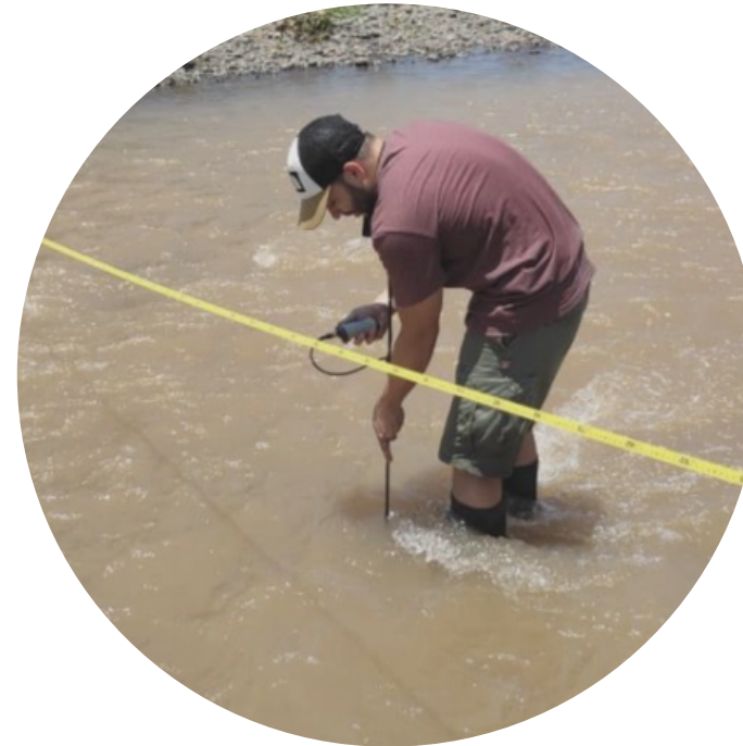
3. SCIENTIFIC RESEARCH