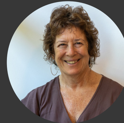
Nice Alterman Treasure